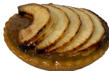
FRENCH APPLE TART

Shelf life: 72hrs Temperature: 4 to 6 degrees Allergies: Soy, Dairy, Gluten, Nuts Alcohol: No Layers of difference textures; Hazelnut dacquoise, crunchy praline feuilletine, dark chocolate mousse and milk chocolate mousse.